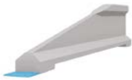
Terminal Element RB80S_4T (inclination 1:5)