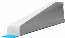
Terminal element REBLOC 80S_4T_S37 (inclination 1:5)